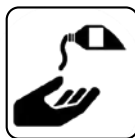
DISINFECTION ON HANDS