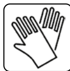
USE OF GLOVES

Failure to comply with the above measures are sanctioned by: