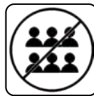
AVOIDING SPACES BOARD