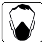
USING THE MASK PROTECTIVE