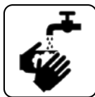
FREQUENT WASHING ON HANDS WITH WATER AND SOAP